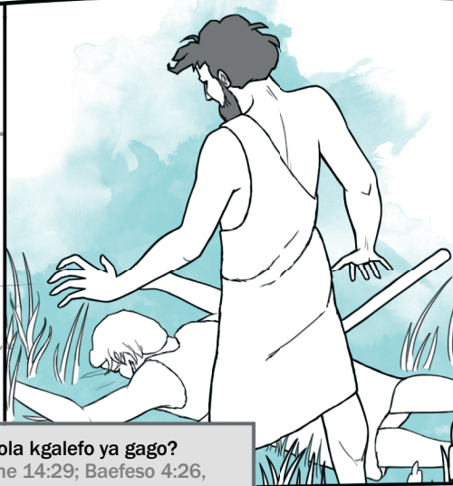
MORAGONYANA, MODIMO O NE A BOTSA KAINE A RE: “ ..... ?”