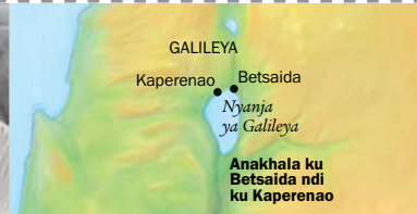
Anakhala ku Betsaida ndi ku Kaperenao