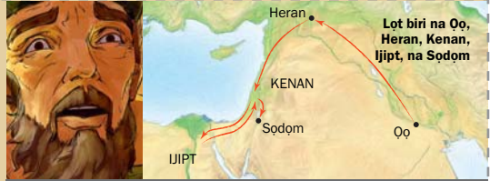
Lot biri na Oo, Heran, Kenan, Ijipt, na Sodom