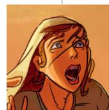
(MWANA WAMKAZI WACHIWIRI)