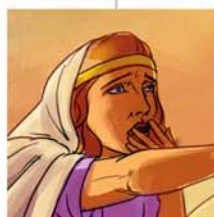
(MWANA WAMKAZI WOYAMBA)