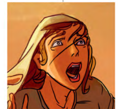
(MWANA MSUNGWANA MUCHOKO)