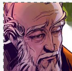
A. Israel, or Jacob

"I HAD NO IDEA OF SEEING YOUR FACE, BUT HERE GOD HAS LET ME SEE ALSO YOUR OFFSPRING." —GENESIS 48:11.