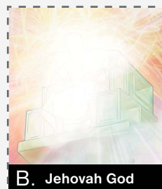
B. Jehovah God