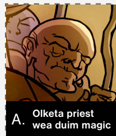
A. Olketa priest wea duim magic

"FINGER BILONG GOD NAO IA!" —EXODUS 8:19 NW.