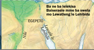
Ba ne ba lelekisa Baiseraele mme ba swela mo Lewatleng le Lehibidu