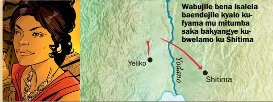
Wabujile bena Isalela baendejile kyalo kufyama mu mitumba saka bakyangye kubwelamo ku Shitima