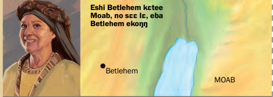
Eshi Betlehem ketee Moab, no see le, eba Betlehem ekonɔ