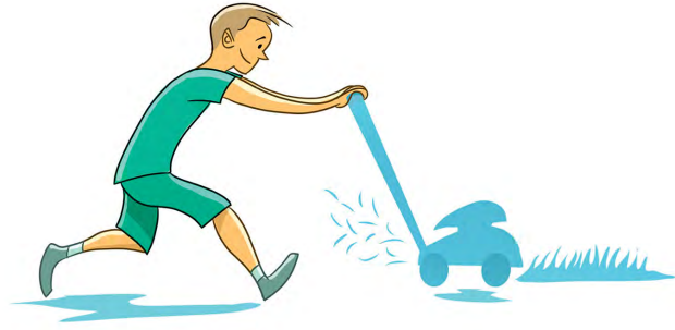
MABASA AUNOFANIRA KUITA