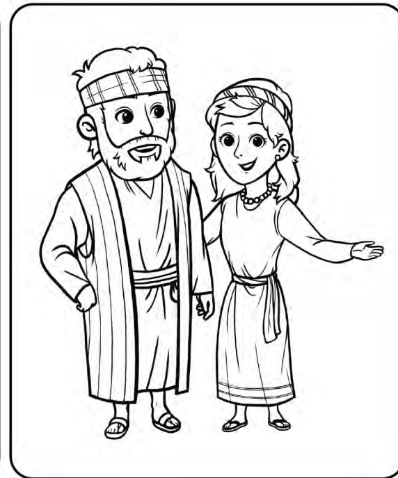
Akwira naPrisira Mabasa 18:1-3, 18, 19

Zvinodiwa naJehovha panyaya yekuroorana zvakachinja here?