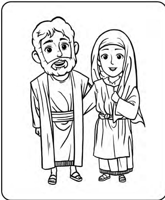
Josefa naMariya Mateu 1:16