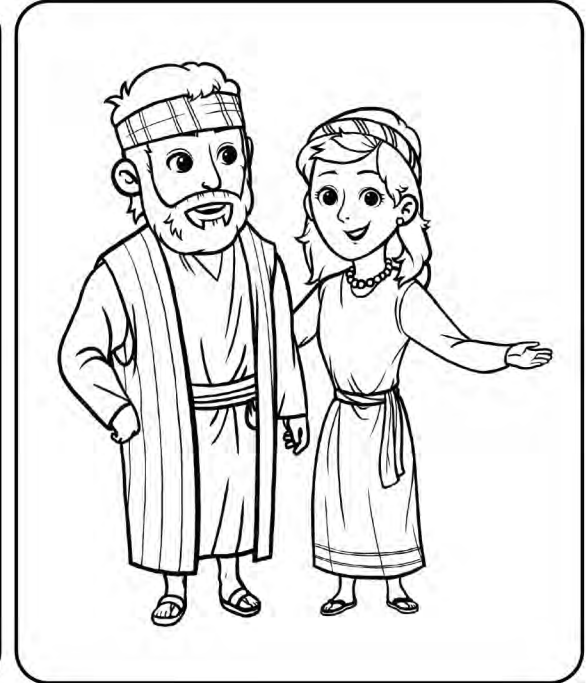
Aquila da Priscilla Ayyukan Manzanni 18:1-3, 18-19

Tsarin da Jehobah ya kafa game da aure ya canja ne?