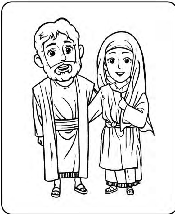
Yozefu na Mariya Matayo 1:16