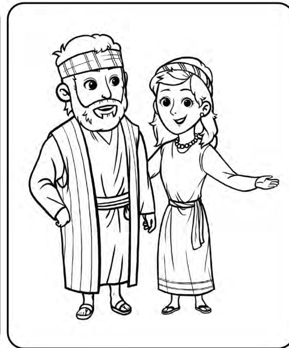
Akwila na Pirisila Ivyakozwe 18:1-3, 18-19

Yehova yoba yarahinduye ukuntu abona ivya mariyaje?