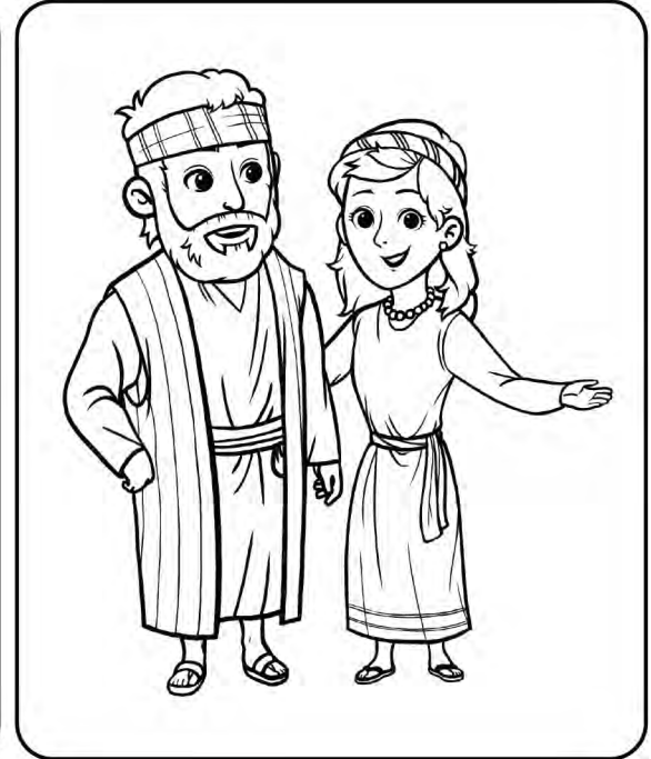
Akhwila le Perisila Ditiro 18:1-3, 18-19

A Jehofa o fetotse tsela e a neng a batla gore lenyalo le nne ka yone?