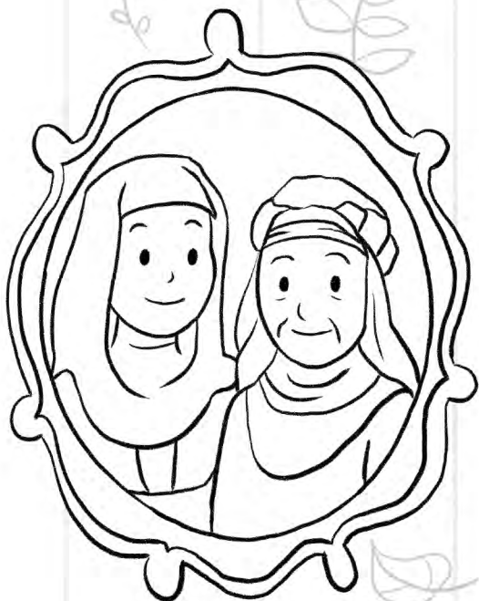
Rusi na Nawomi

Umuntu uko yoba angana kwose, yokubera umugenzi mwiza mu gihe akunda Yehova. Bavyeyi nimusomere abana banyu Rusi 1:16, 17. Hanyuma muganire ukuntu abantu bakuze bo mw'ishengero bobabera abagenzi. Bana nimusige amakurere ayo mashusho ari aho hepfo. Aho hatagira ishusho, mumadikeho ifoto yanyu muri kumwe n'umugenzi akuze wo mw'ishengero canke mwicape muri kumwe.