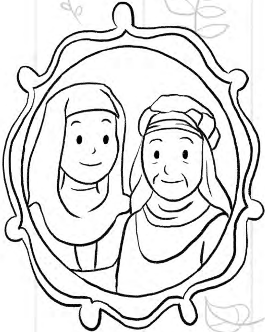
Ruthe le Naomi

O ka nna le ditsala tsa mmatota fa fela ba rata Jehofa. Batsadi, balang Ruthe 1:16, 17 le bana ba lona. Go tswa foo, tlotlang le bone ka se ba ka se dirang go nna ditsala le batho ba ba godileng mo phuthegong. Bana, khalarang ditshwantsho tse di fa tlase. Go tswa foo, torowa kgotsa tsenya setshwantsho sa gago le mongwe wa ditsala tsa gago tse di godileng.