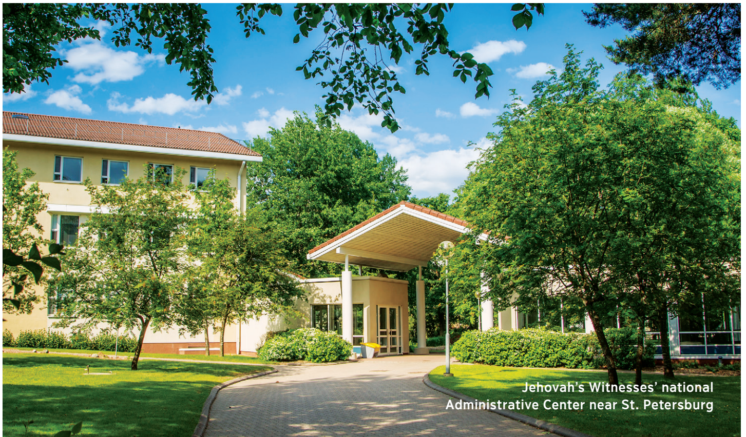
Jehovah's Witnesses' national Administrative Center near St. Petersburg

The Supreme Court has scheduled a hearing on the liquidation claim for 5 April 2017 at 10:00 a.m.